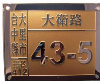
House number plate 門牌