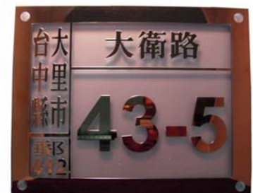
House number plate 門牌